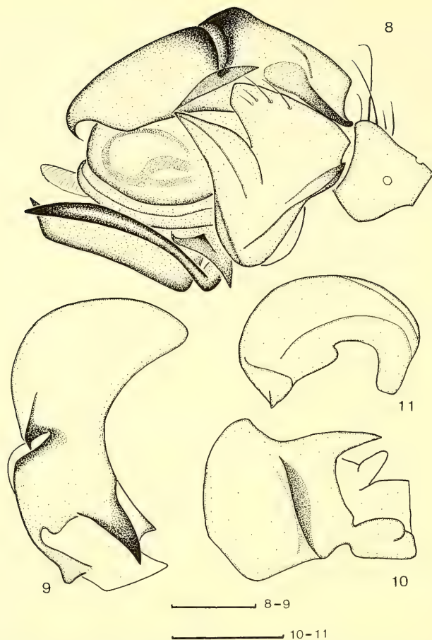
Figs. 8-11. Troglodyphantes adjaricus spec. nov.; ♂ holotype. -8) left palp; 9, 10) cymbium (prolateral and dorsal view, respectively); 11) embolus.

Diagnosis: The new species joins the orpheus -group and seems to be especially closely related to deelemanae spec. nov., but is well different from the latter by the lack of a basal tubercle on the male palpal tibia and of a dorsal abdominal pattern, certain details of the shape of the cymbium, absence of a tegular and presence of a radical membrane of the palp.